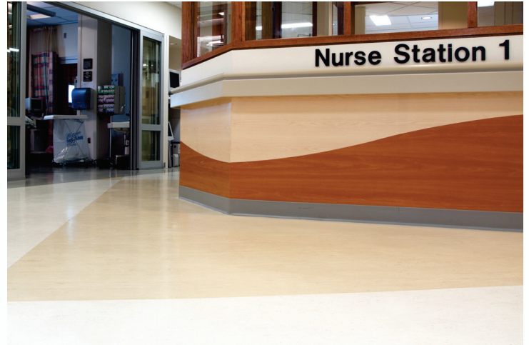
Charleston Area Medical Center