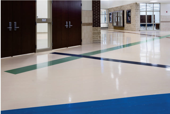
Wysong Elementary School

From active children in school to a busy medical staff in a large metropolitan hospital, heavy traffic is no match for FlexiFlor Sheet Rubber Flooring. This specially formulated, premium grade flooring is made for the most demanding heavy traffic applications.